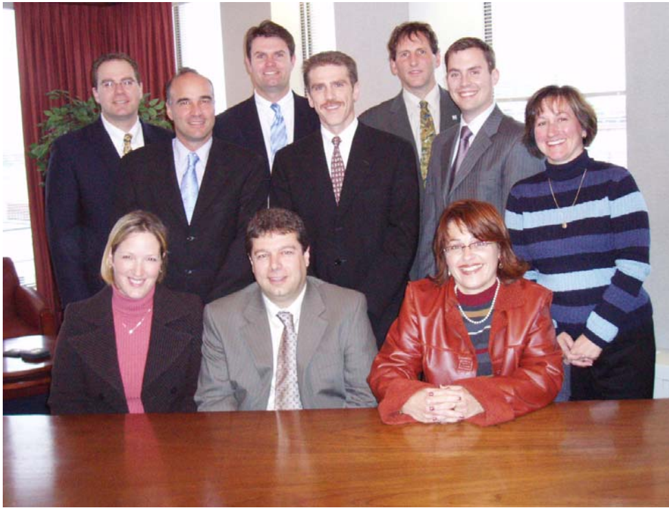
CFA Atlantic Board of Directors